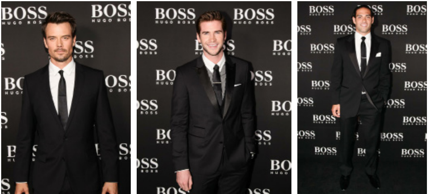
From L to R: Josh Duhamel; Liam Hemsworth; Mark Sanchez

Josh Duhamel was one of the uniformly impressed audience members. "I want to sit and watch it again, with just me watching it," he shared. Why alone? "I was talking to Mark Sanchez during the whole thing. We were watching it, but we were also talking about football at the same time."