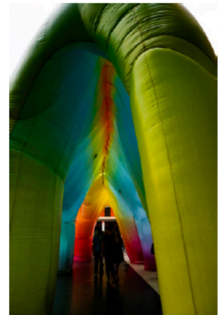
Inside FriendsWithYou Sculpture