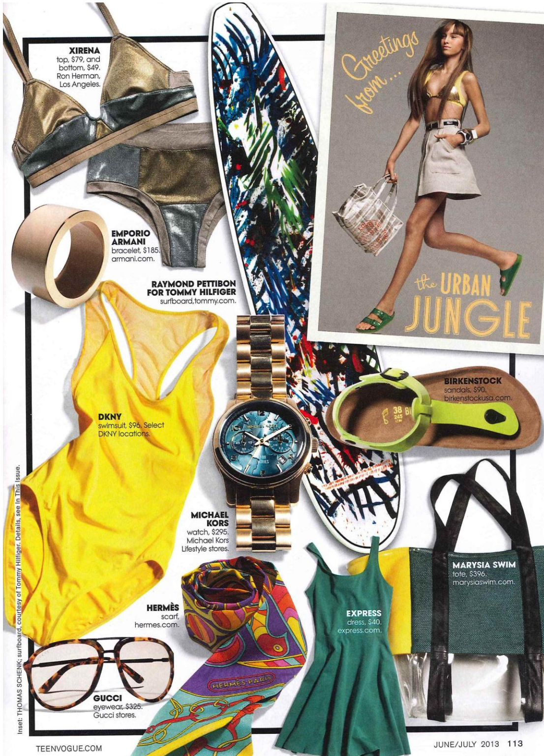
XIRENA top, $79, and bottom, $49. Ron Herman, Los Angeles.