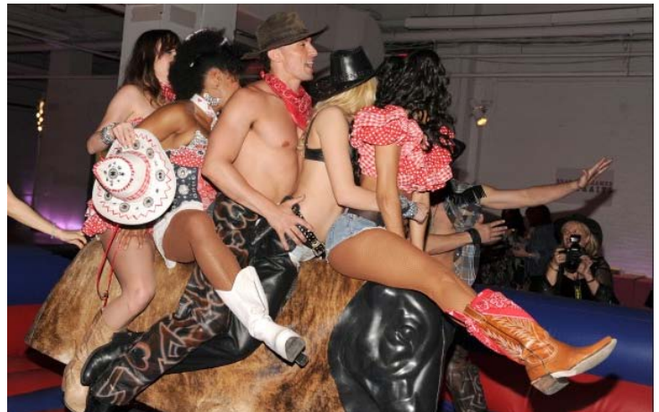
(From L to R) Ellen von Unwerth reclines on hay bales; Performers re-enact Madonna's "Don't Tell Me" video.