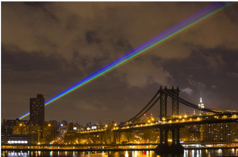
'global rainbows' by yvette mattern image © james ewing courtesy of art production fund

the visual exhibit of light aims to symbolize hope and act as a call to action to support the communities that were devastated by the hurricane. visible for up to 35 miles depending on atmospheric conditions, the rainbow-like laser beams illuminated the night skies from november 27 - 29, 2012. despite its significant range, the lasers used a minimal amount of power, approximately 24 amps or the equivalent of two hairdryers.