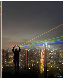
lasers from one end of new york to the other