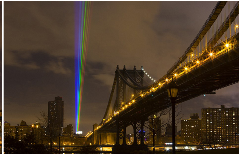
35 mile long lasers over new york for tribute to hurricane sandy victims