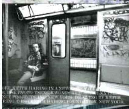
OFF: KEITH HARING IN A NEW YORK SUBWAY TRAIN, 1984. DRAWING BY KEITH HARING. © 1984 KEITH HARING FOUNDATION, NEW YORK.