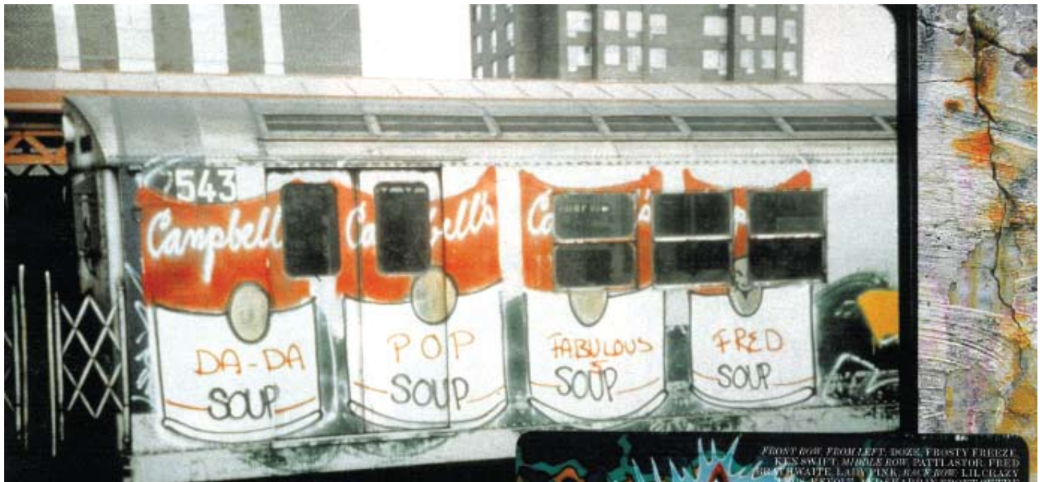
CAMPBELL'S SOUP TRAIN BY FRED BEATHWAITE IN NEW YORK, 1981.