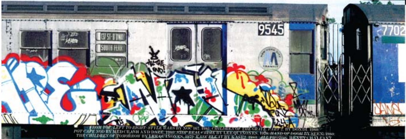
FROM TOP, LEFT TO RIGHT: STYLE BARN BY NOC 167, 1981; CHILDREN OF THE GREAT BARKS BY DONDI, 1980; POT CAPE NOD BY MED CRASH AND DAZE, 1980; STOP REAL CRIME BY LEE QUINONES, 1978; HAND OF DOOM BY SEEN, 1980; THE CHILDREN OF TOMORROW BY LEE QUINONES, 1979; KASE BLK BY KASE, 1980.