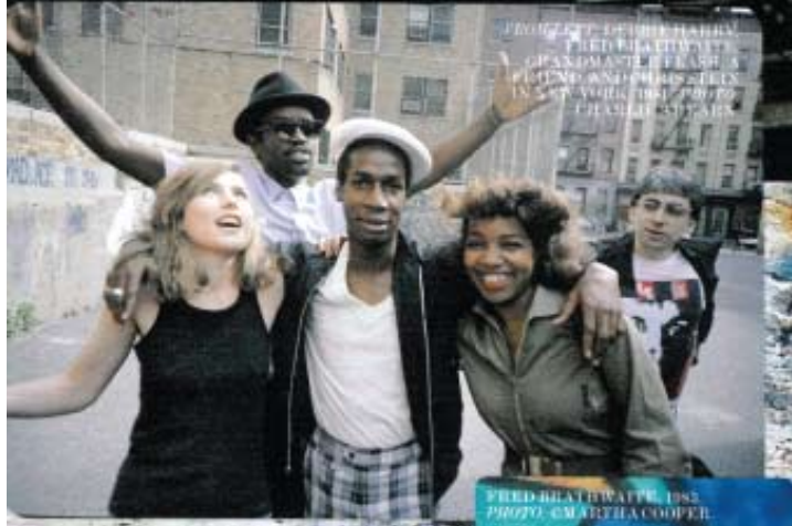
FRONT ROW: KEITH HARING, FRED BEATHWAITE, GIPANO, MASTIFF, AND OTHERS AT THE OPENING OF THE '85 ARTS AND CULTURE CENTER IN NEW YORK CITY.