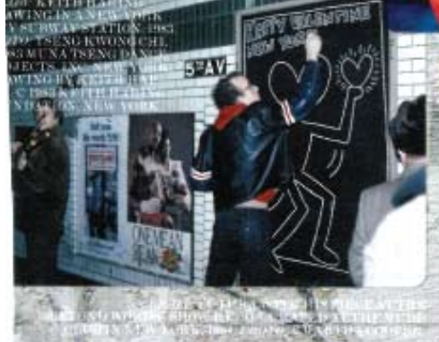
OFF: KEITH HARING PAINTING IN A NEW YORK SUBWAY STATION, 1985. DRAWING BY KEITH HARING. © 1985 KEITH HARING FOUNDATION, NEW YORK.