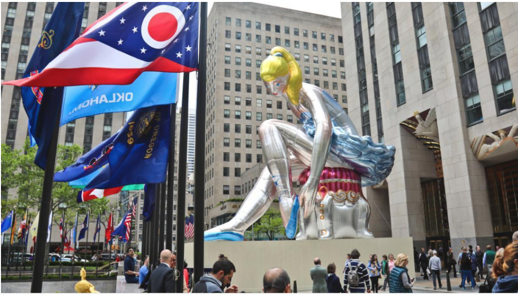
"Seated Ballerina", center.