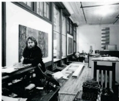
STUDIO APARTMENT | Donald Judd, 101 Spring Street, New York, First Floor, 1910

While other artists try to capture the effects of light, James Turrell uses it as a medium—cutting ceilings, placing mirrors and digging into the earth to direct its rays. Beginning June 21, the Guggenheim will host a large-scale retrospective of his work, featuring a new site-specific work called "Aren Reign" that will transform the museum into a brilliant oasis. It's a unique marriage between the artist and museum architect Frank Lloyd Wright. "Wright himself was no lover of cities, and thought of the Guggenheim as a place where people could temporarily escape the urban environment, stepping inside to greet the light of nature," says curator Nat Tretman. "Turrell's attraction to the space is not coincidental; he has taken advantage of this aspect of the museum to create a space where people can settle into a contemplative space and momentarily forget the hustle and bustle of the city." Through Sept. 25. 1071 Fifth Ave., guggenheim.org — Heather Corcoran