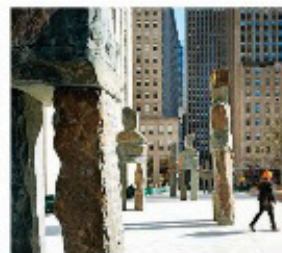
EN PLEIN AIR From top: Summer's outdoor exhibitions include colossal sculptures by Ugo Rondinone; Alex Israel's self-portrait on the Bowery.

When Donald Judd purchased the five-story, cast-iron building at 101 Spring Street for his home and studio in 1966, he set to work cementing his legacy on his own terms. The building, where the iconic artist lived until his death in 1994, is home to a Judd-curated permanent installation of more than 1,000 works of art, including some by his minimalist (a classification he reportedly hated) contemporaries Carl Andre and Dan Flavin. Now, after a three-year restoration, the Judd Foundation is opening the reservations line for guided tours on June 3, the 85th anniversary of the artist's birth. juddfoundation.org — HC