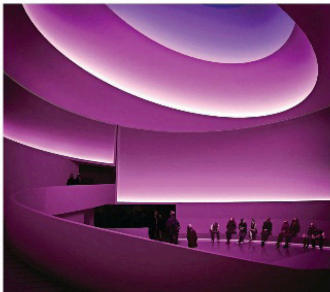
PURPLE HAZE James Turrell's "Aren Reign" will transform the rotunda of the Guggenheim with LED light and daylight.