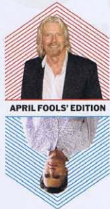
APRIL FOOLS' EDITION