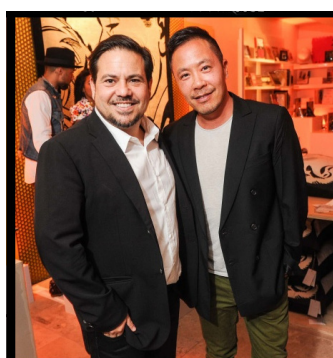
Narciso Rodriguez and Derek Lam