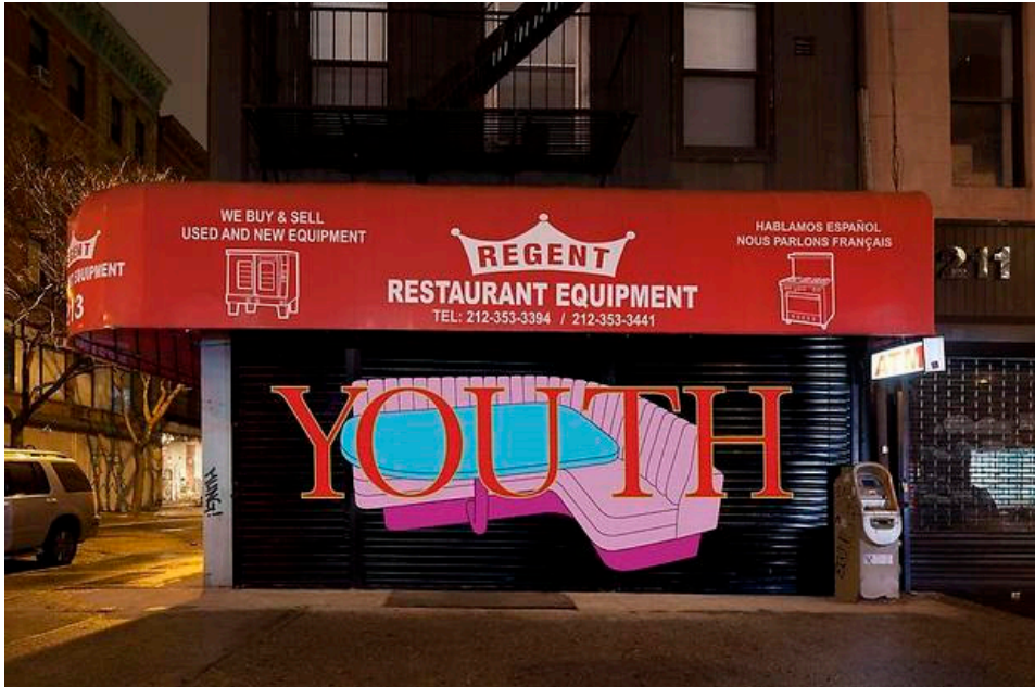
Rendering by Michael Craig-Martin, courtesy of Art Production Fund